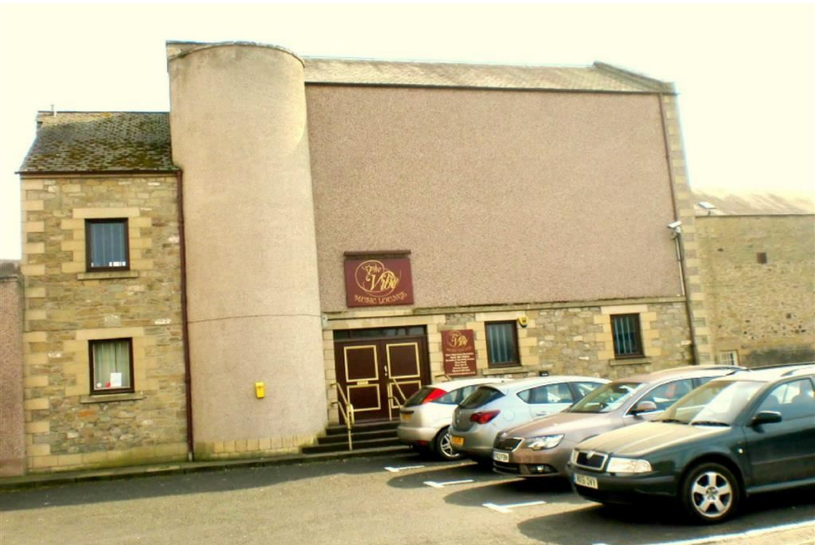
Vault Square, Kelso - £350,000