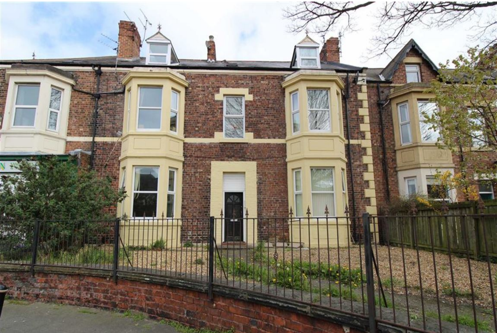
Clarence Crescent, Whitley Bay - £290,000